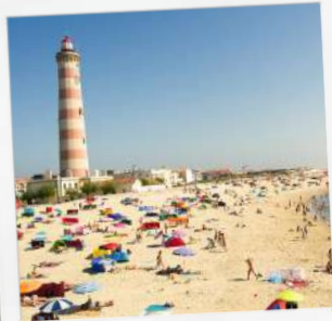
Aveiro - Praia da Barra