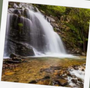
Cascata da Cabreia