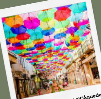
Águeda City - Festival Agit'Águeda