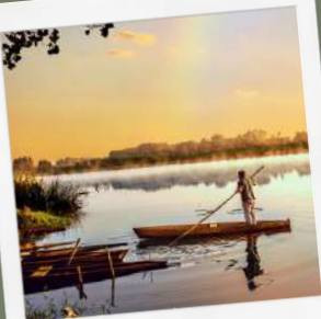
Pateira de Fermentelos