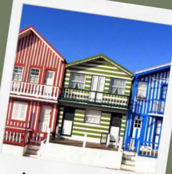
Aveiro - Costa Nova

Agência Nacional Erasmus+ Juventude/Desporto Corpo Europeu de Solidariedade