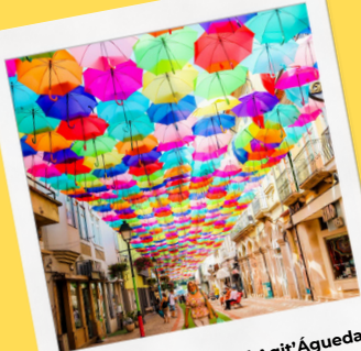
Águeda City - Festival Agit'Águeda