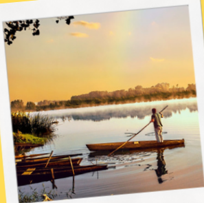
Pateira de Fermentelos