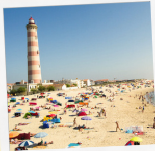
Aveiro - Praia da Barra